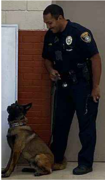
Longview Police's K-9 Unit was a great program *****